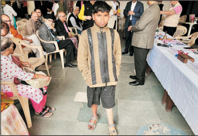
Another beneficiary walking comfortably