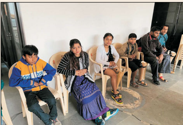
Beneficiaries who are provided with Artificial Limbs