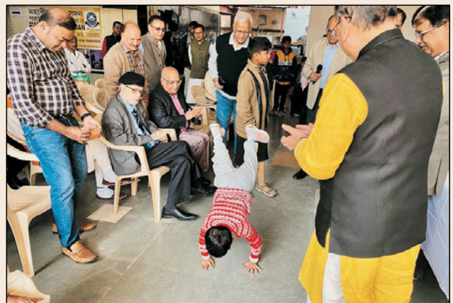
DG and other dignitaries were highly impressed with cheerful kid