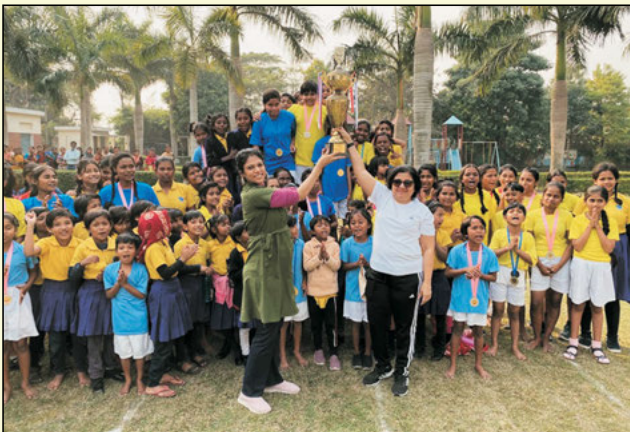
Champion house of the Athletic meet 2024 being awarded by RCCM