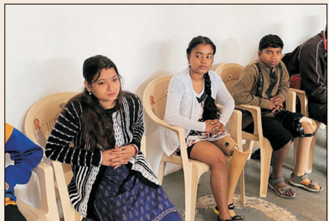
Another of beneficiaries