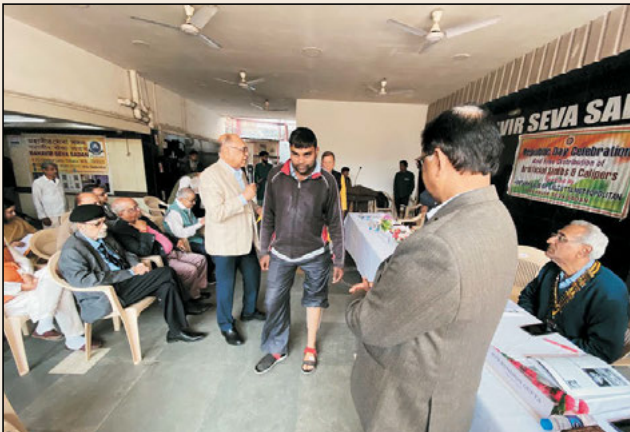
DG looking at the Artificial Limbs provided to the beneficiary