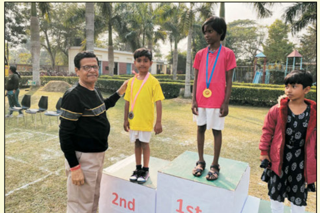
Winners of 50 mtr flat race for class-UKG