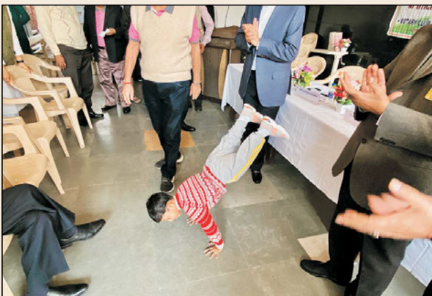
The kid doing acrobatic to the audience