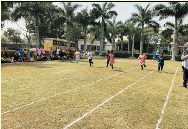
Teachers participating in 50 mtr race