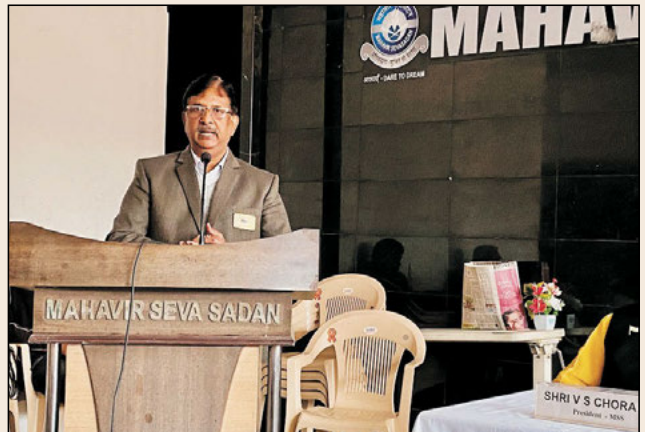
DG announcing District-3291 and Rotarians support for this project