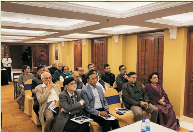
Listening the speakers in rapt attention