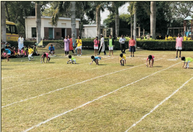
UKG and Class-I students participating in Chocolate race