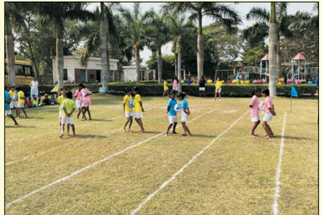
Class-IV and V students competing in Ballon race