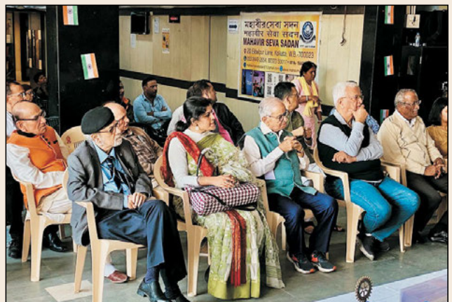
Audience listening the DG in rapt attention