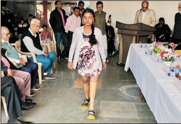
Beneficiary showing th artificial leg provided