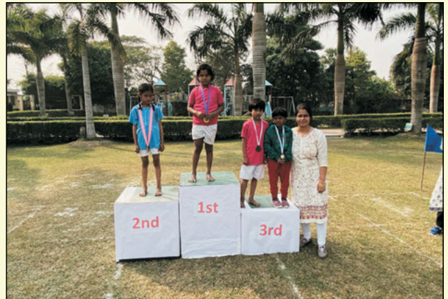
Winners of Chocolate race class-UKG & I