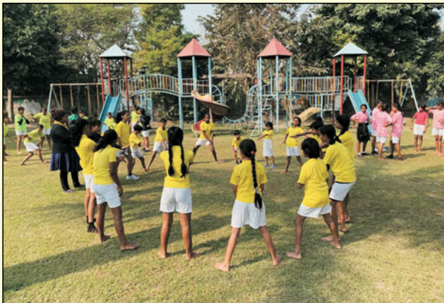
Students getting warm up before the start of sports