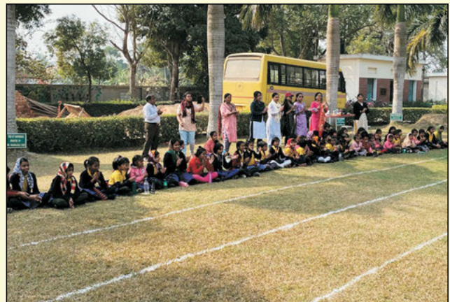
Students and teachers enjoying the sports

We congratulate the team of PACE Learning Centre for successful organizing the sports events in a well-disciplined manner.