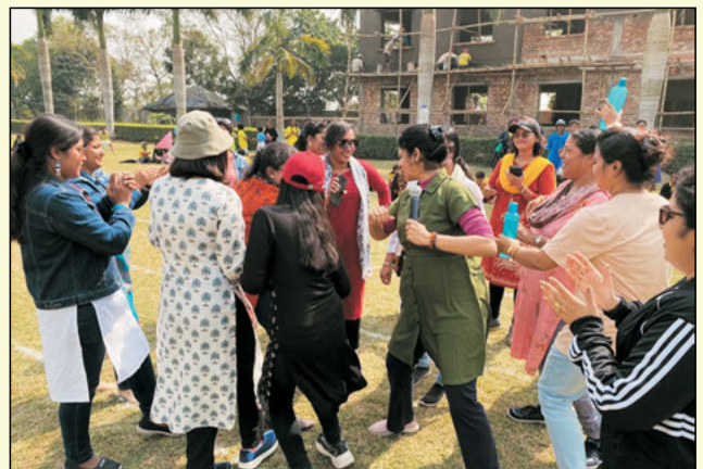
Another view of dancing teachers