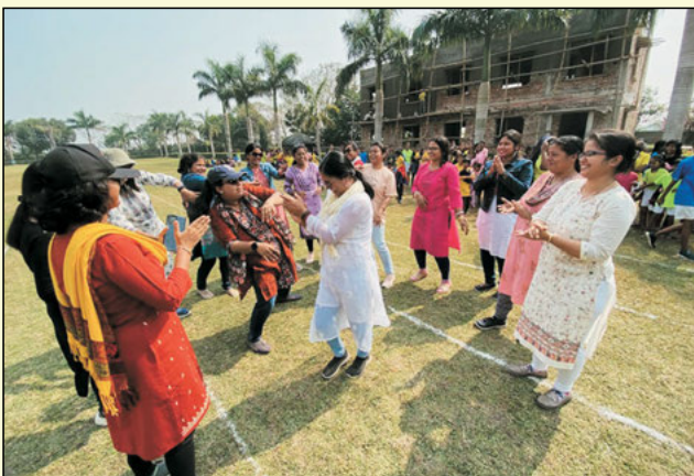
Teachers enjoying the dance