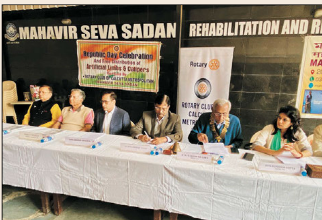
A view of Head table

After the President of RCCM done his Club business and the Secretary making necessary Club announcements, the meeting was terminated.