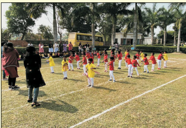
Opening of sports with Dance by the students