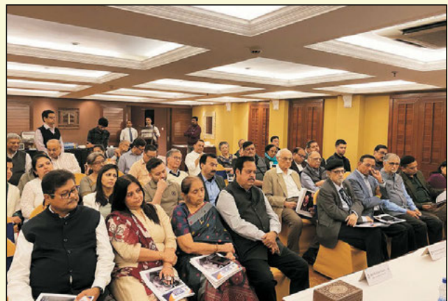
Members and Guests paying homage