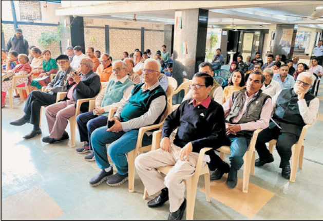
A view members and guests