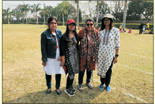
Dancing corner-North House teachers