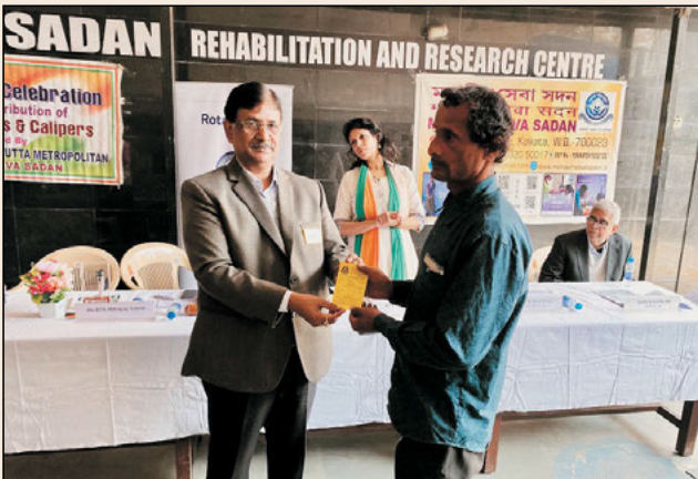
DG handing over Free Life Long Card for providing the Artificial Limbs8