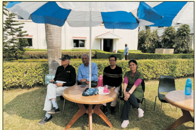
RCCM represented by their President and other Metropolitans