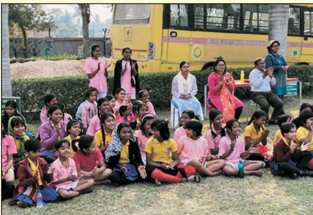
Non-participants students & teachers