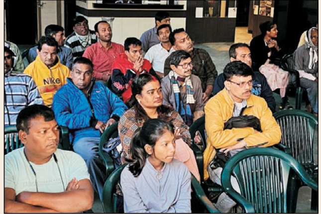
A view of beneficiaries