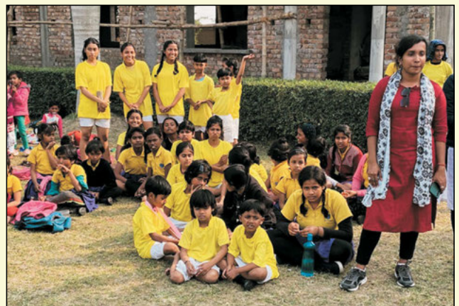
North House participants watching the events