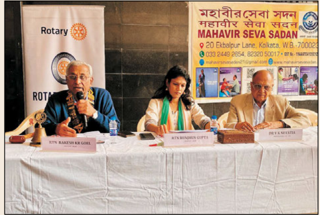
President announcing the commitment for providing Artificial Limbs