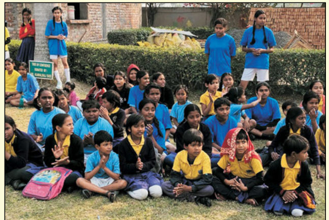
West house participants