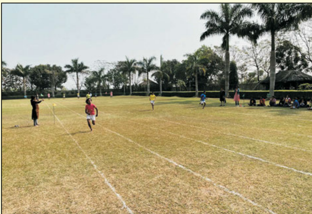
200 mtr relay race for class VI and VIII