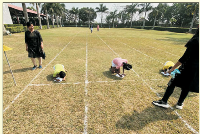
Students participating in Math race