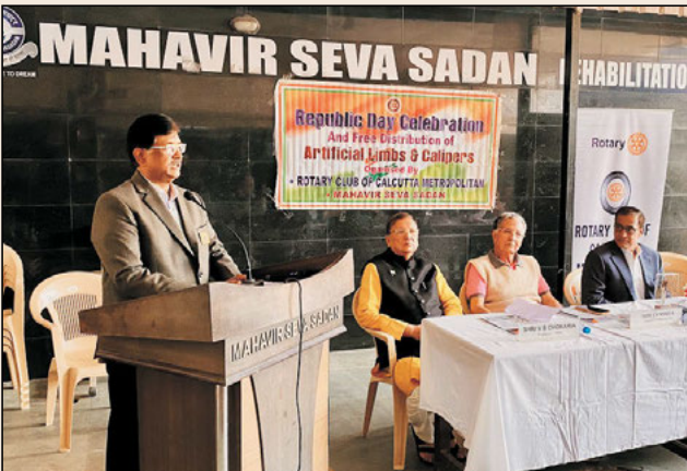
Another view of DG address