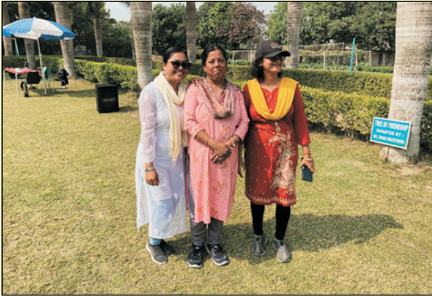
Dancing corner event winner West House